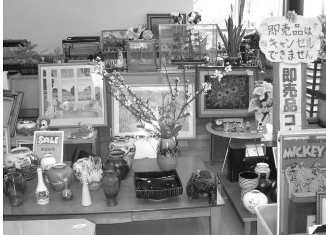
▲ Display space of recycle products for lottery held in 16<sup>th</sup> every month