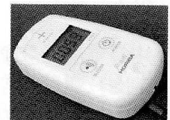
(株)堀場製作所製 環境放射線モニタ PA-1000 Radi

●Application: Kankyō-ka TEL 049-251-2711 Ext.299