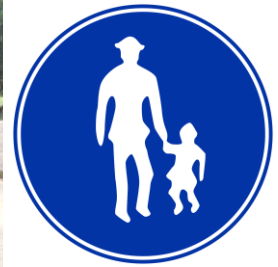
Signal for pedestrians